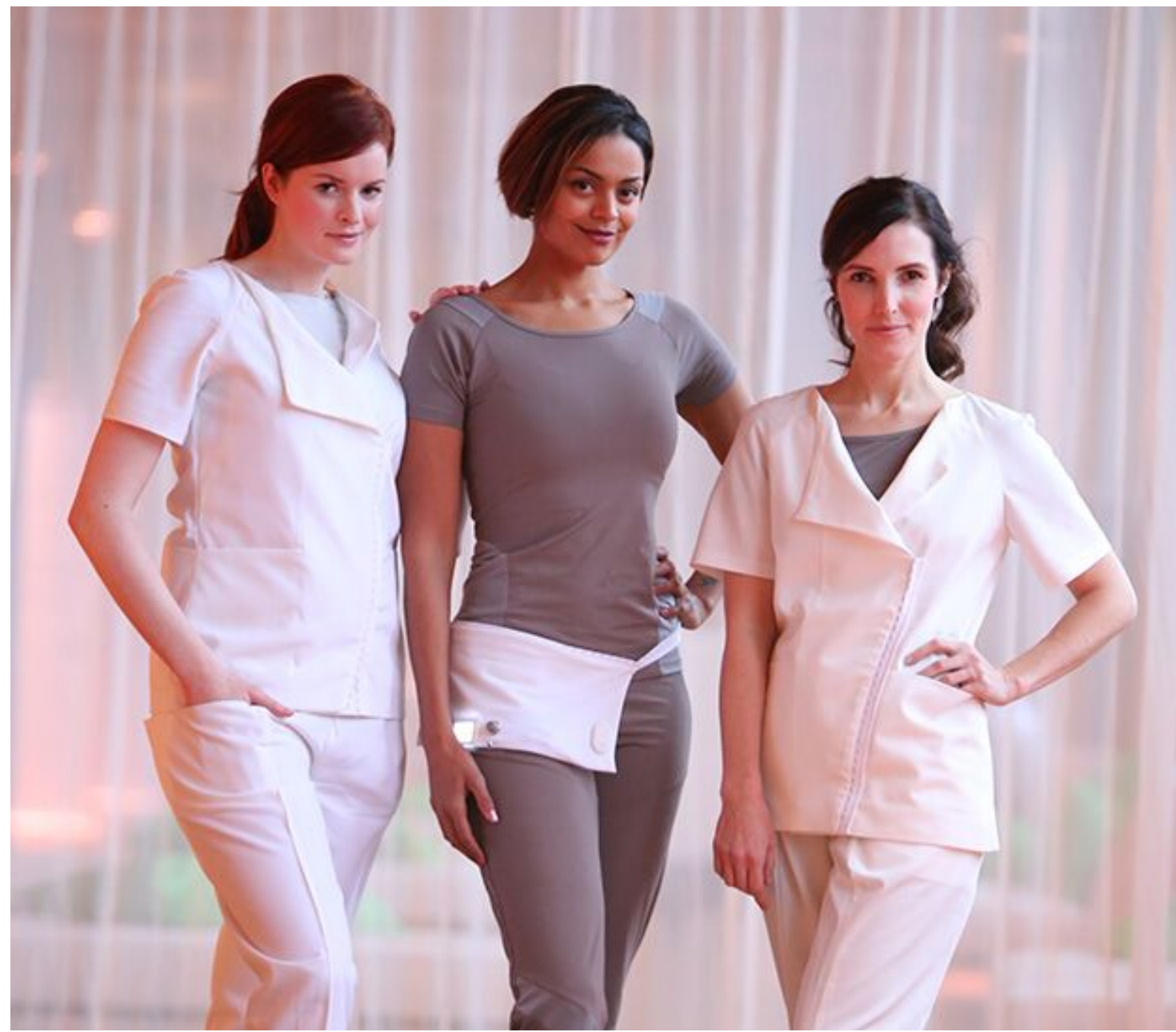
Zorgzame Bedrijfskleding Marina Toeters